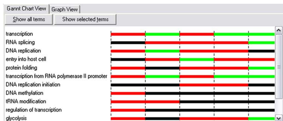
Fig. 3 Gantt chart view of selected GO terms. Each bar represents a window of time, with up-regulated terms labeled in red, down regulated terms in green and terms not enriching any cluster in the window labeled with black

We also suspect that what is true of the biological examples presented here may also hold for many other domains: e.g., financial domains with syntactic variables: prices and volumes of stocks, and information retrieval domains with syntactic variables: click streams or hyperlinks. The GOALIE system is designed to be highly